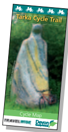
Tarka Trail Cycle leaflet (see page 24)

This is the least well known but most peaceful and tranquil part of the Tarka Trail. It's a really wonderful quiet and scenic stretch that heads south on the old railway path through East Yarde towards Petrockstowe and Meeth. Ahead of you, there are some great views of Dartmoor National Park, as you sail through wooded and remote countryside leading to the clay workings.