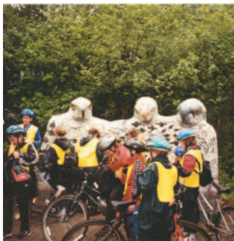
Tarka Trail sculpture

The restored Instow Signal Box, built in 1873, is worth a stop. You may also like a short diversion off the route to paddle along the sandy shore at Instow and wander amongst the shoreline shops.