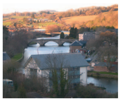
View of Totnes by Cliff Morley

This second route starts at the station car park, take a right turn at the river end of the station car park and bus turning circle alongside Borough Park with views of Totnes Norman castle to your right. You pass alongside a Health Centre car park, across the main road at the lights, past the supermarket entrance and the TIC in Coronation Road -this is all traffic free except for the last part into the area known as the Plains, by the historic Totnes Bridge over the Dart. The Plains is a lively bustling area with a good selection of shops close by and a park beside the river. With the river Dart on your left, as the Plains narrows and where the 'All through Traffic' road sign directs motor vehicles to turn right, continue straight on into New Walk and cycle on the road which runs parallel to the river until you reach the Steam Packet Inn on the banks of the River Dart. Here a sharp right turn leads you up a short stretch of Moat Hill until, on your left, you see the gates of the start of Sharpham Drive. Although moderately strenuous at times, from this recently resurfaced former Carriage Drive you will not only see great views of the river but also pass mature trees and woodlands and unfenced pasture. So, do not be surprised if you see flocks of sheep and a herd