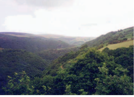
East Lyn Cleave

After the bridge cross the main road ahead to the grass verge with the "steep hill" and "road bend" signs; walk up this to the sharp bend at the top. At the top follow the path ahead signed to Lynmouth, with a MW symbol on the post (the symbol of the Two Moors Way).