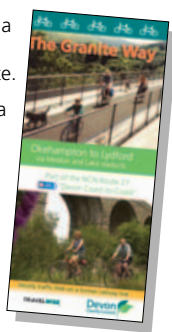
Granite Way leaflet (see page 24)

At Lydford the Castle is well worth a visit. It has an imposing keep which was a former gaol and the scene of many hangings!