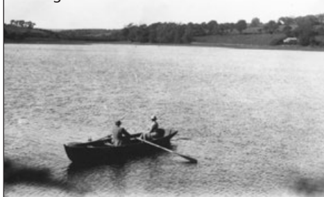
Boating on Tamar Lakes

The canal closed in 1901 following the arrival of the railway in Bude and the consequent loss in trade. However, the reservoir and the Aqueduct continued to play a role in local water supply until the second half of the 20th Century.