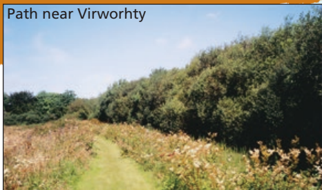
Path near Virworthy