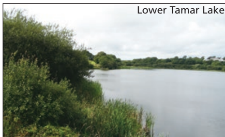
Lower Tamar Lake

lived. Today, the old store is owned by the Bude Canal Trust. It is open to the public and contains information about the history of the canal.